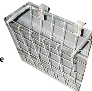
Item Code 298-047