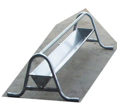
Item Code 298-045